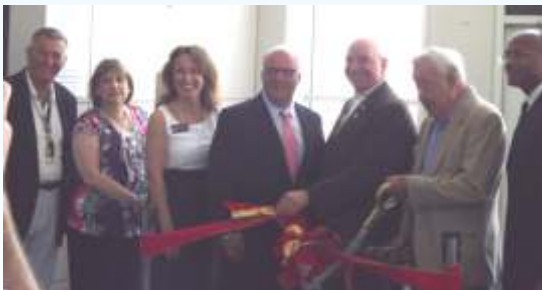
The official ribbon cutting at the gate.

From Allentown (ABE) to Orlando (MCO), departs at 11:40 a.m. and arrives at 2:00 p.m. on Tuesdays and Saturdays