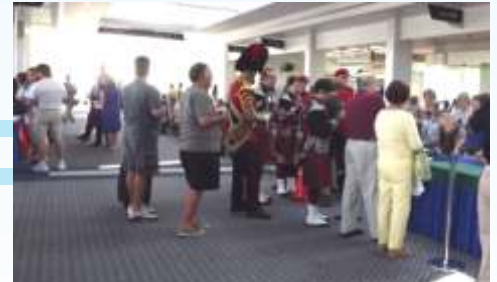
The community enjoys the festivities.