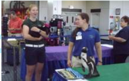
Lehigh Valley Zoo animals were a real crowd pleaser.